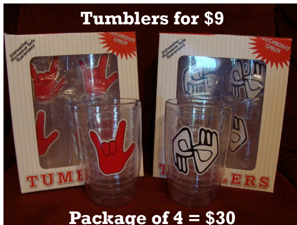
Package of 4 = $30