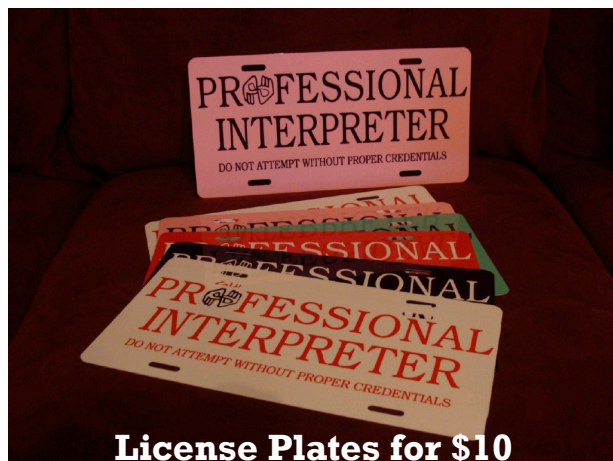
License Plates for $10

DO NOT ATTEMPT WITHOUT PROPER CREDENTIALS