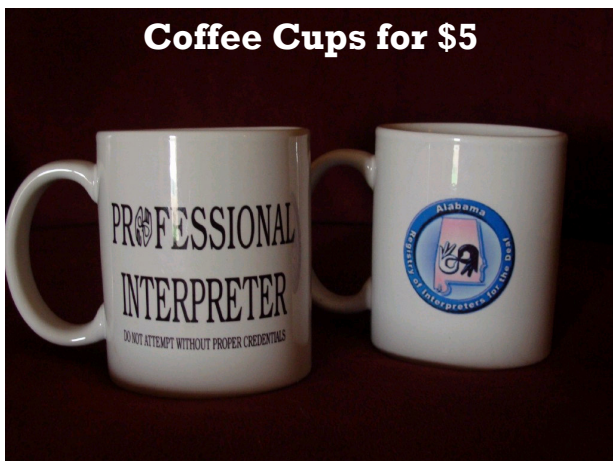
Coffee Cups for $5