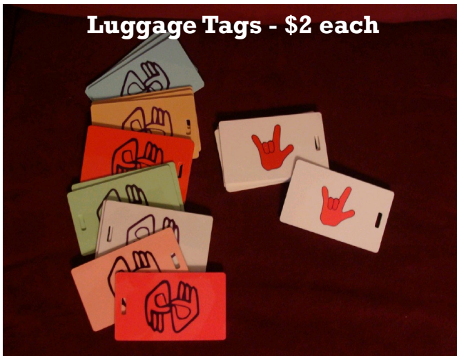
Luggage Tags - $2 each