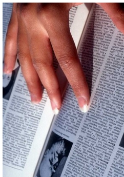
Hands ARE communication

The parents of Gwinnett County Georgia understand the benefits of offering ASL curriculum in their local schools. They have been working tirelessly to convince Gwinnett County Public Schools to add ASL to their curriculum. Their deadline to send in