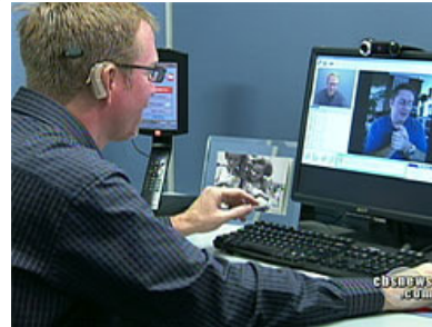
A man uses a service that provides video interpreters that translate sign language for the deaf. Twenty-six people were arrested Nov. 19, 2009 in a scheme to steal millions from the service.

For more information: http://www.cbsnews.com/stories/2009/11/19/cbsnews_investigates/main5713910.shtml